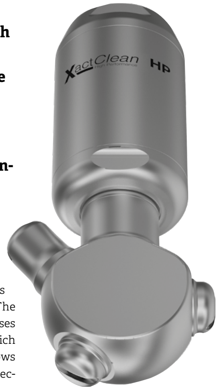
Lechler Xactclean HP rotary cleaner.

In addition to tank dimensions, the level of contamination is a crucial factor in nozzle selection. For this reason, the installed nozzles vary depending on the project. The concept of cleaning efficiency classes introduced by Lechler in 2014, which categorizes the entire portfolio, allows for a transparent and traceable selection process. The classification ranges from simple rinsing to light and medium soiling, all the way to stubborn dirt. With the help of custom simula-